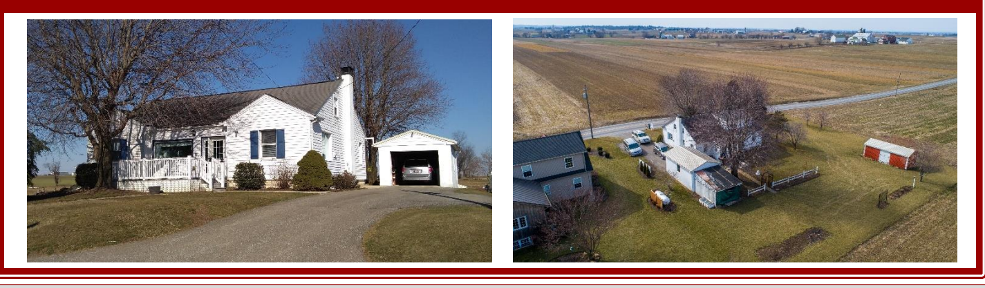
Directions: From Gap take Strasburg Road west 6.5 miles, turn left onto Esbenshade Road to property on the left.

234 Esbenshade Road, Ronks, PA 17572- Lancaster County