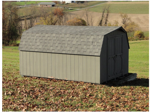
For more pictures go to <a href="www.beiler-campbellauctions.com">www.beiler-campbellauctions.com</a> <a href="www.auction.zip.com">www.gotoauction.com</a>