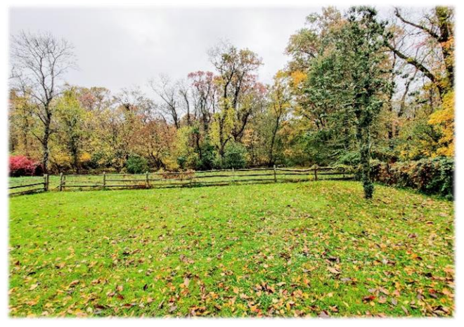
For additional pictures go to <a href="www.beiler-campbellauctions.com">www.auction</a> zip.com