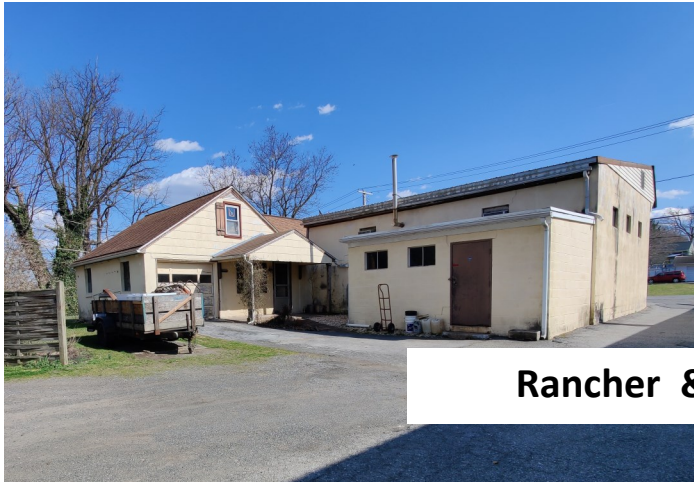
Rancher & Rear Yard