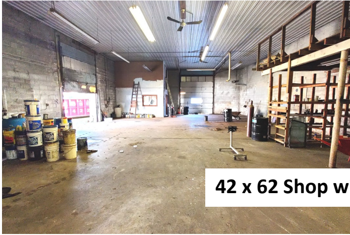
42 x 62 Shop with 16 ft. Ceilings