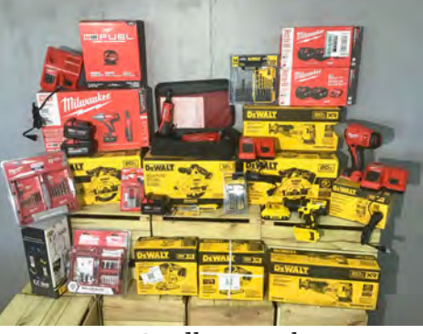
New Cordless Tools