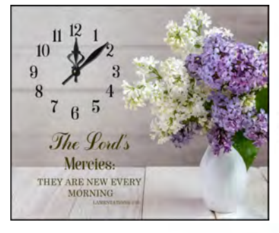
Timeless Harmonies Music Clock