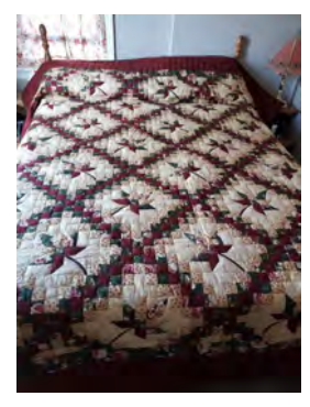
Irish Chain Maple Leaf - Many Quilts