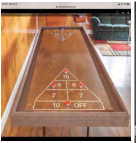
Table Shuffle board