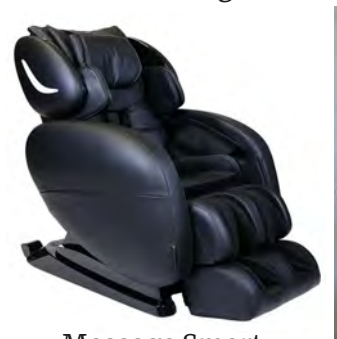
Massage Smart Chair X3