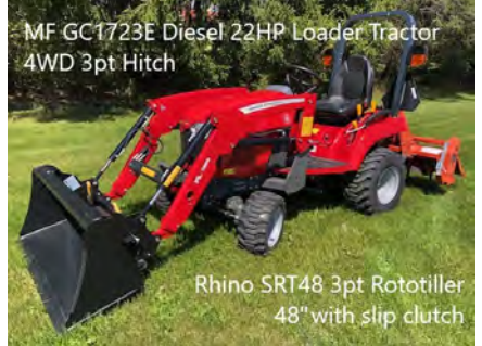
MF GC1723E Loader Tractor

6:30 AM Breakfast | 8:30 AM Auction Begins | 10:00 Theme Baskets | 11:00 AM Remarks by CSC Doctors & Staff | 12:00 Quilts | 12:00 Carriages | Lawn Furniture | Household Furniture | 1:00 Toys | Silent Auction Ends 1:00