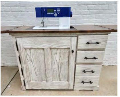
Sewing Machine Cabinets