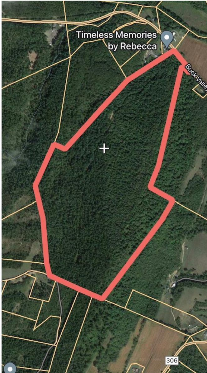
Auction Parcel #1 178.9 Acres