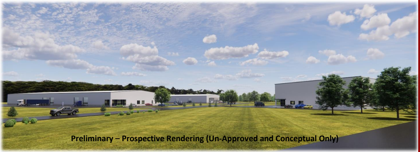
Preliminary – Prospective Rendering (Un-Approved and Conceptual Only)

810 Simmontown Rd, Gap, PA 17527- Lancaster County